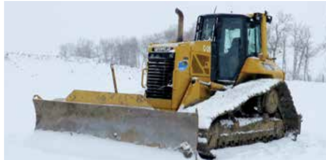
1 of 14 – Caterpillar D6N LGP