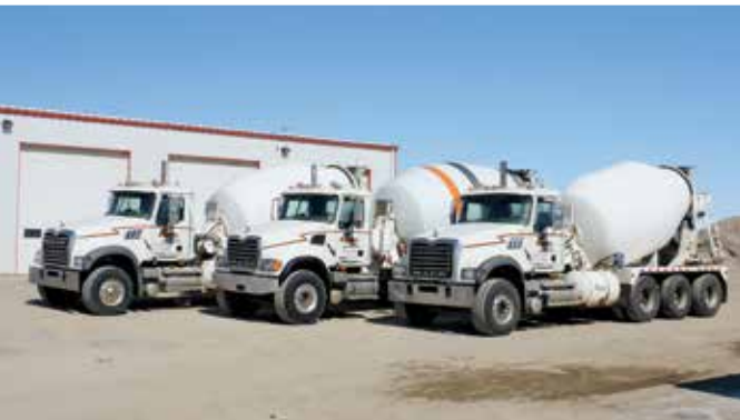
2009 Mack GU713, 2009 Mack GU700 Granite & Mack CV713 Granite