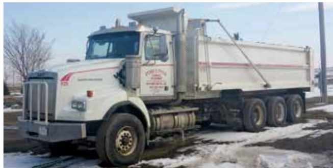
2010 Western Star 4900SA