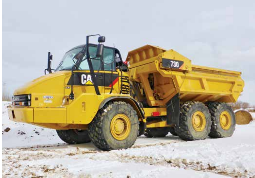
2013 Caterpillar 730EJ Ejector 6x6