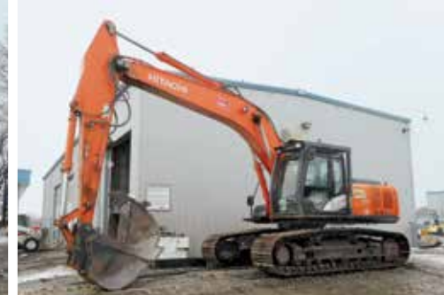
1 of 3 – 2012 Hitachi ZX290LC-5