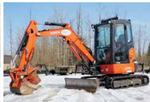
2014 Kubota U35-4