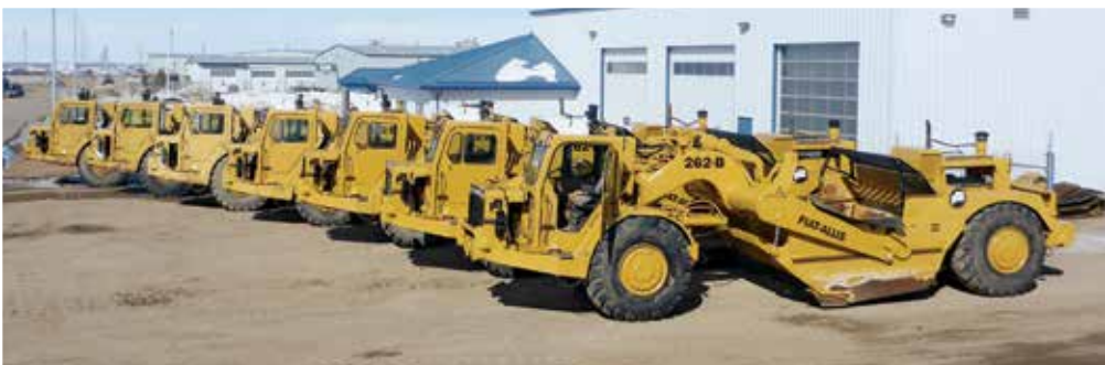
7 of 8 – Fiat-Allis 262B