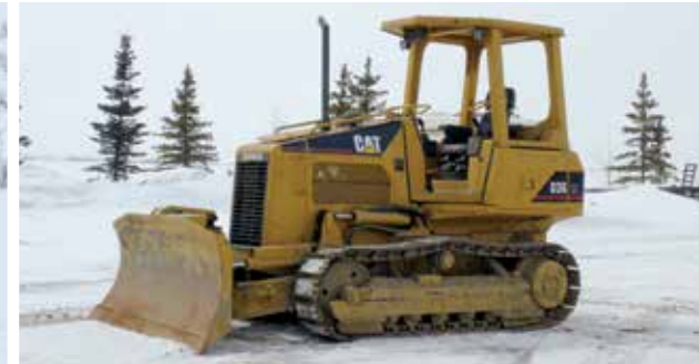
1 of 2 – Caterpillar D3G XL