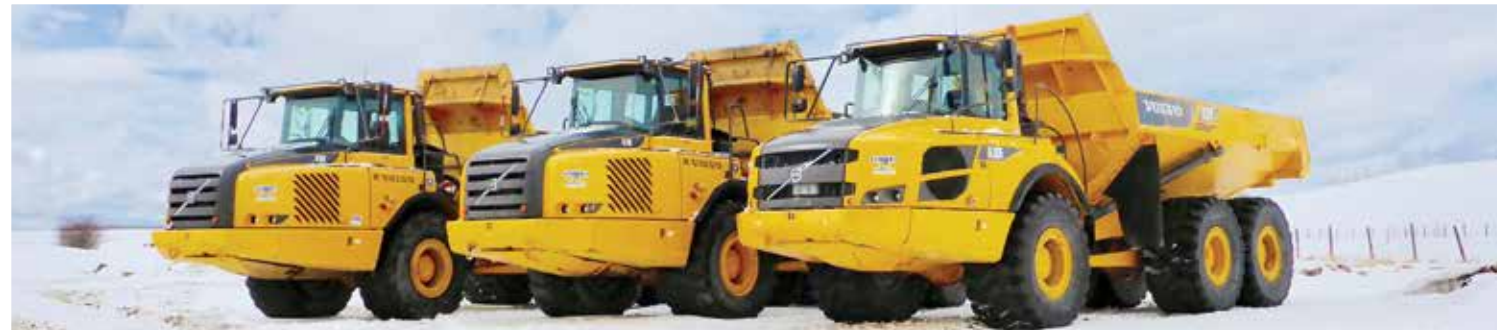
2012 Volvo A30F 6x6 & 2 of 4 - Volvo A30E 6x6