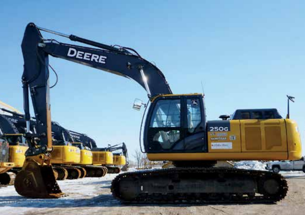
1 of 2 – 2017 John Deere 250G LC