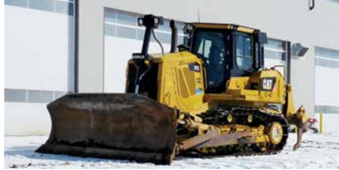
2011 Caterpillar D7E