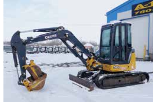
2014 John Deere 35G