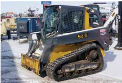
1 of 3 – 2012 John Deere 323D