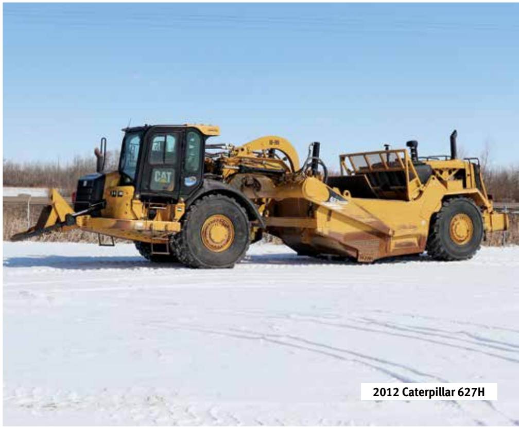
2012 Caterpillar 627H