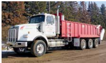
1 of 2 - 2010 Western Star 4900SA