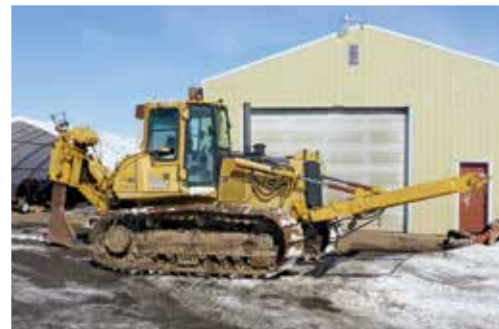
John Deere 850C WXLT Series II