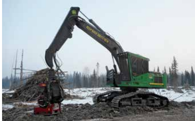
1 of 2 – 2013 John Deere 2154D