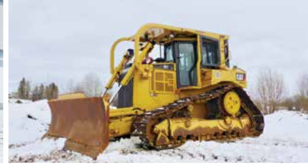
1 of 2 – 2009 Caterpillar D6T LGP