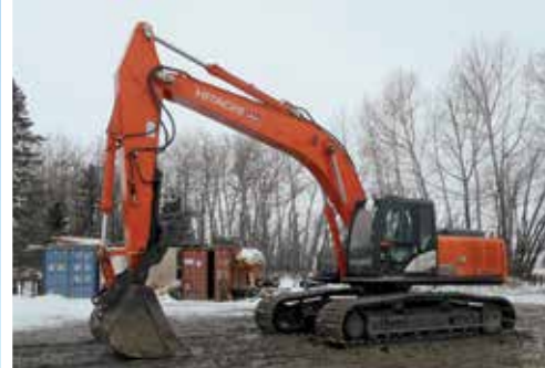
1 of 4 – 2013 Hitachi ZX290LC-5N