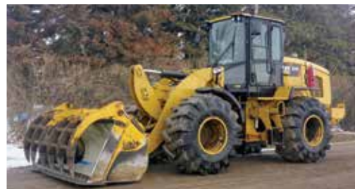
2015 Caterpillar 924K