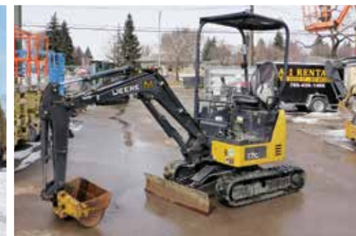
2015 John Deere 17G