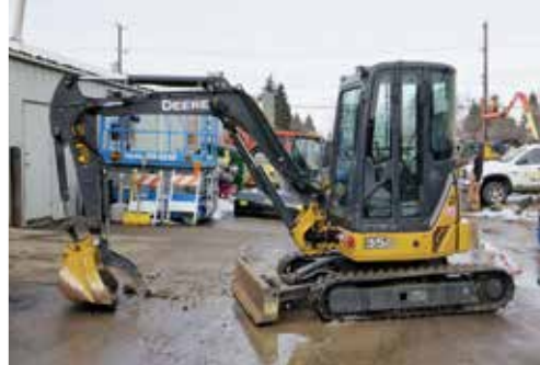
2013 John Deere 35D