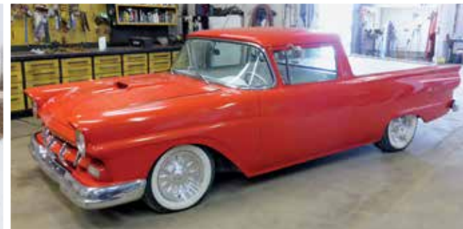
1957 Ford Ranchero