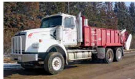
1 of 2 - 2011 Western Star 4900SA