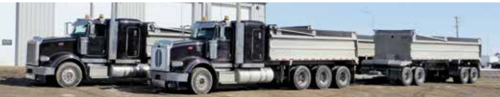
2 of 3 – 2014 Peterbilt 367 & 2 of 3 – 2014 Capital 26 Ft