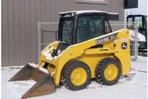
2010 John Deere 313