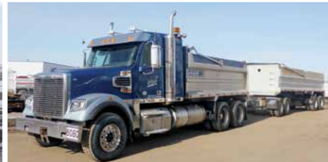
2014 Freightliner SD122 Coronado & 2014 JP's