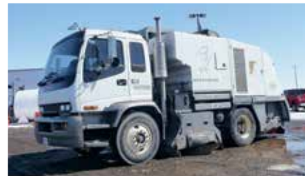
1 of 2 - GMC T7500 Centurion