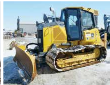
2015 John Deere 650K LGP