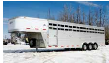
Unused - 2015 Universal Exiss STK828