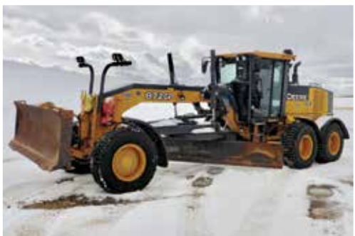
2011 John Deere 872GP AWD