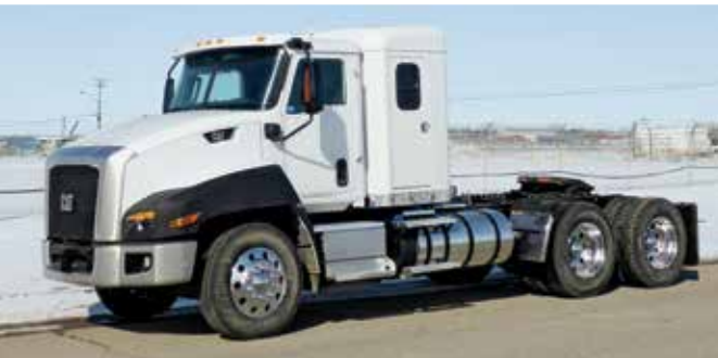
2015 Caterpillar CT660S