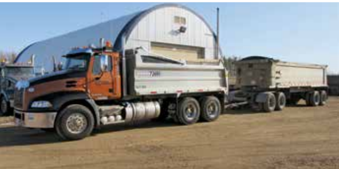
2016 Mack CXU613 & 2013 East 27 Ft