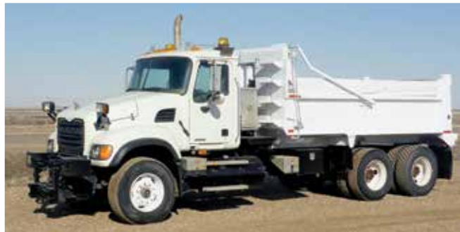
1 of 3 – Mack CV713 Granite