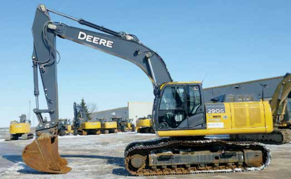
1 of 2 – 2017 John Deere 290G LC