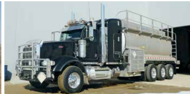
2014 Peterbilt 367