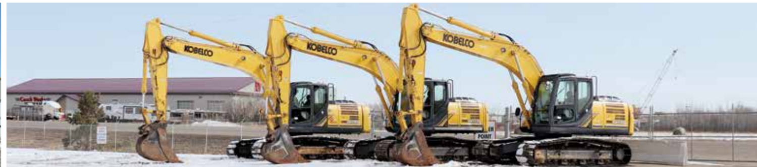
2014 Kobelco SK260LC-9 & 2 – 2014 Kobelco SK210LC-9