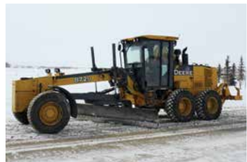
1 of 2 – John Deere 872D AWD