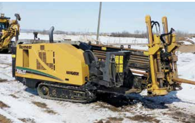
2014 Vermeer D20X22 Navigator