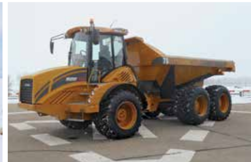
2012 Hydraema 922HM 6x6