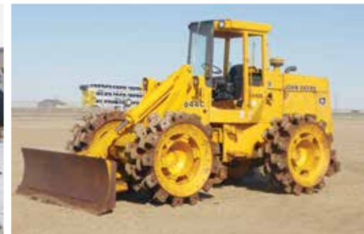
John Deere 644C