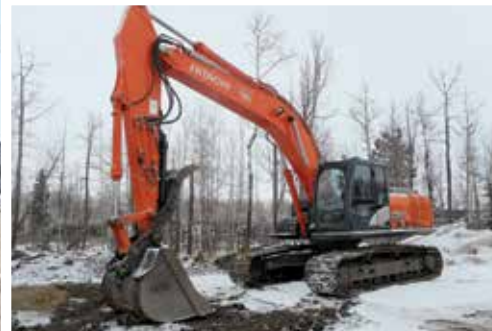
2012 Hitachi ZX250LC-5N