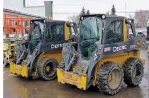
2 – 2015 John Deere 320E