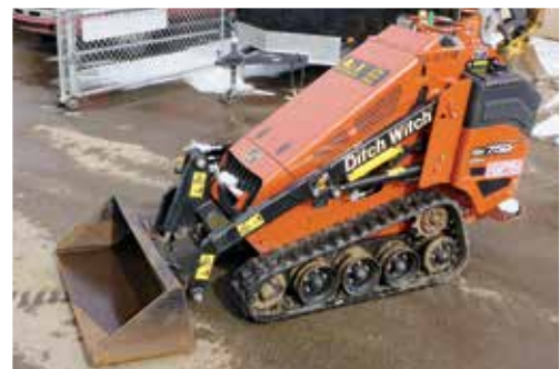
1 of 2 – 2015 Ditch Witch SK750