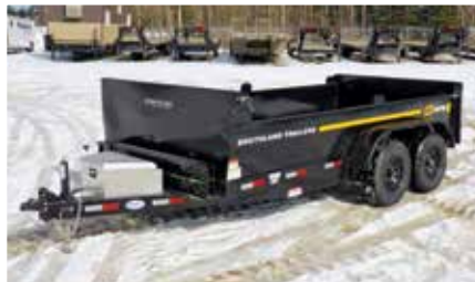
Unused - 2018 Southland SL270T14B