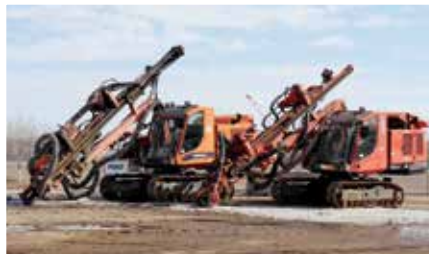
Sandvik 800 & Sandvik 700