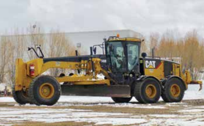
2010 Caterpillar 14M VHP Plus