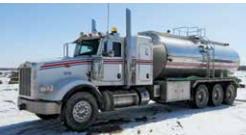
2014 Peterbilt 367 19000 Litre Potable