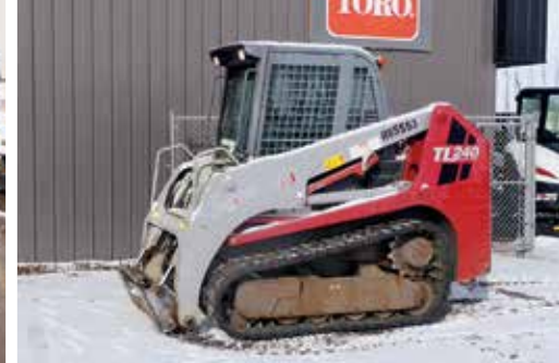
2010 Takeuchi TL240