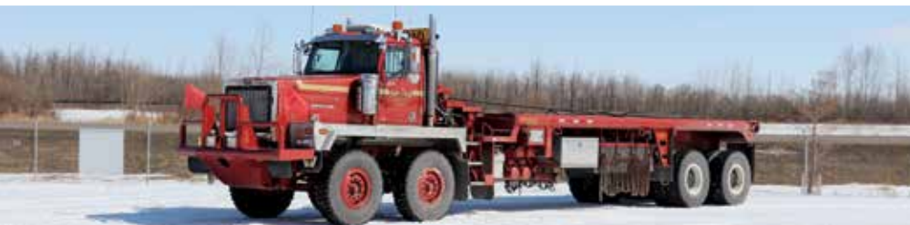
2012 Western Star 6900TS