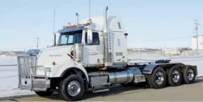
2012 Western Star 4900SB Heavy Haul