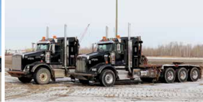
2 – Kenworth T800 Texas Bed Winch