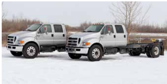
2 – Unused – 2015 Ford F650 XL