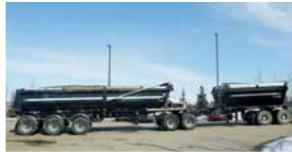
1 of 3 - 2014 Arnes 20 Ft Lead & 1 of 3 - 2014 32 Ft