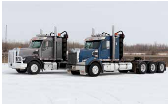
2014 & 1 of 2 – 2012 Freightliner Coronado SD122 Heavy Haul