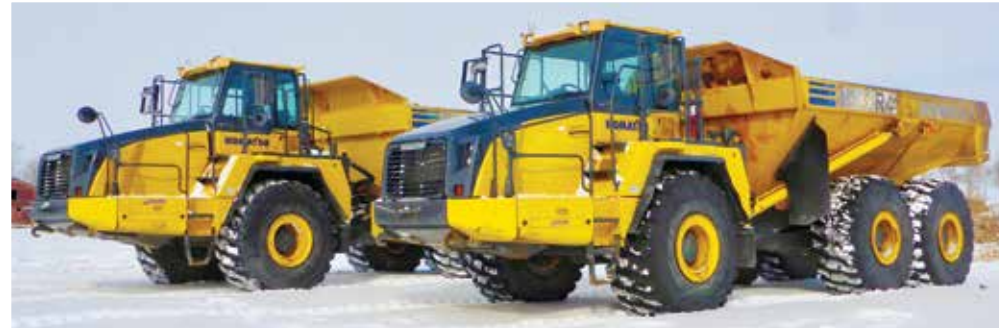
2 of 3 - 2013 Komatsu HM400-3 6x6