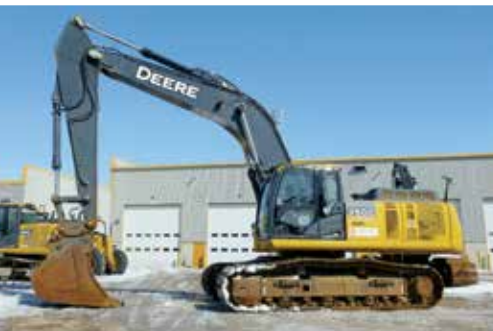
1 of 2 – 2015 John Deere 350G LC