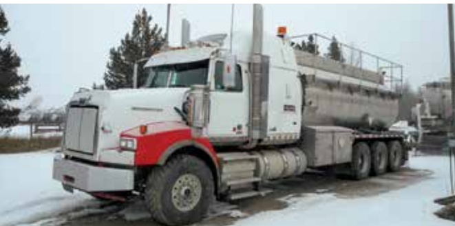
2015 Western Star 4900SA 21146 Litre