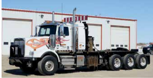
2015 Western Star 4900SB Winch