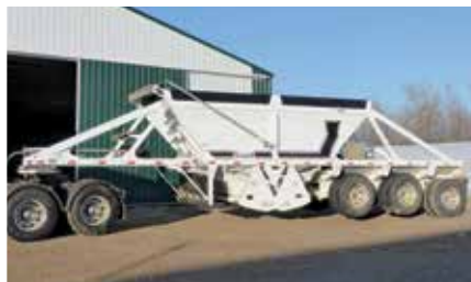
2016 Castleton 38 Ft