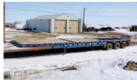
2011 Stellar 24 Wheel