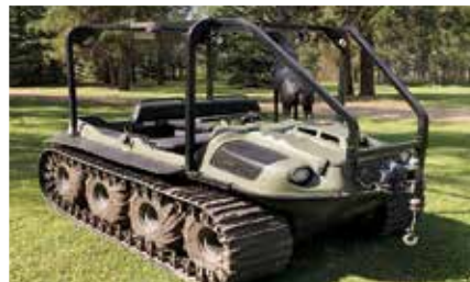
2012 Argo Avenger 780