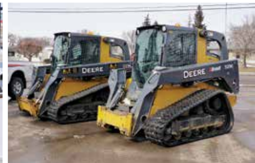
2 – 2015 John Deere 329E