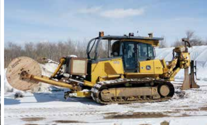
2011 John Deere 850J LGP