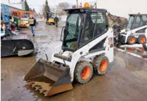
2011 Bobcat S70