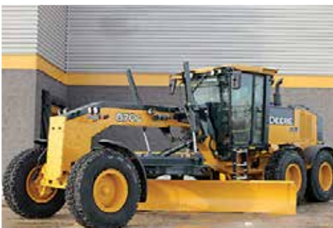
2010 John Deere 870G