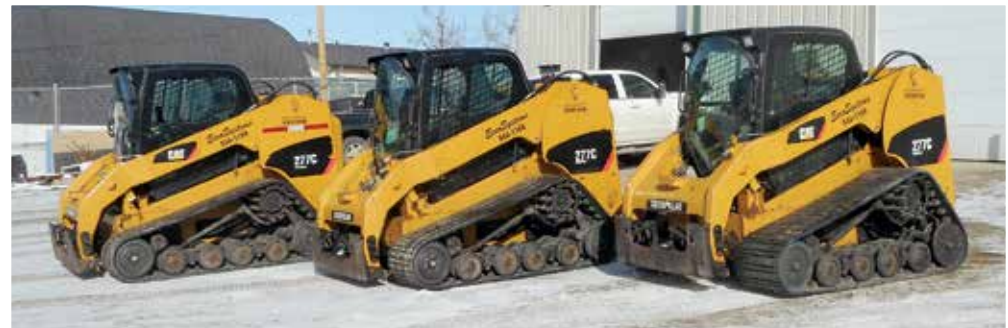
3 – 2010 Caterpillar 277C