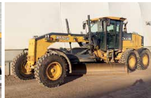
2010 John Deere 770GP