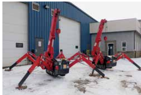
2 - Unic URW295CUR 2.9 Ton