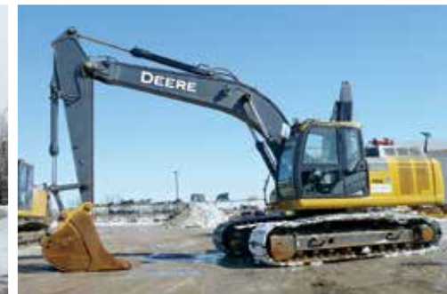
1 of 3 – 2016 John Deere 210G LC