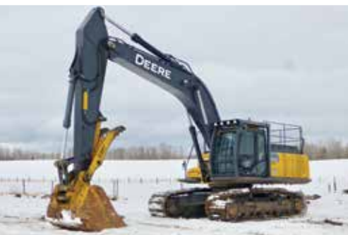
1 of 2 – 2012 John Deere 350G LC