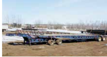
Gerrys 53 Ft 16 Wheel & Gerrys Lo Profile 16 Wheel