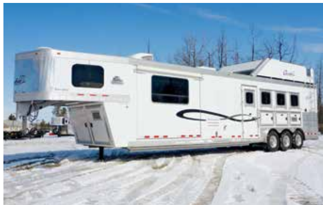
2016 Welch Cherokee Super Chief

» See complete and up-to-date listings for this auction at rbauction.com