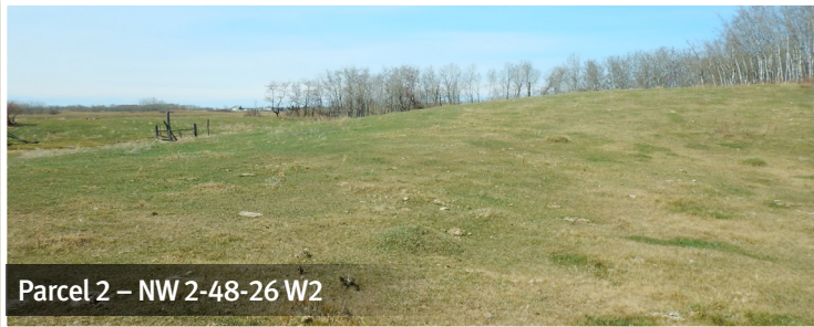
Parcel 2 – NW 2-48-26 W2