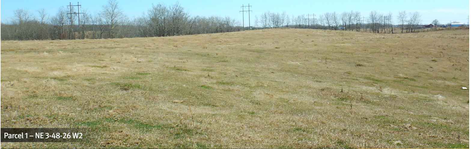
Parcel 1 – NE 3-48-26 W2