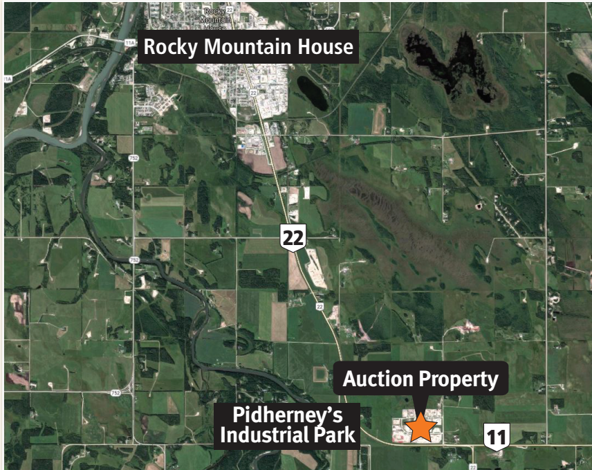
Rocky Mountain House